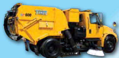
MODEL HSP® High Speed Performance for Airport Runways

Specifications subject to change without notice.