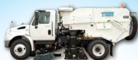
MODEL 600® Conventional Cab Chassis