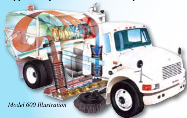
Model 600 Illustration

We want you to understand the Regenerative Air System and your TYMCO sweeper completely, so you can get optimal performance from your equipment investment. That's why, for more than twenty-five years, we've offered two-day scheduled training schools at our facility in Waco, Texas. Owners, managers, operators and mechanics get hands-on training and answers to specific questions. Enrollment levels are kept low, so you and your team will get personal attention as well as the opportunity to learn from the experiences of other attendees through the interaction of the class.