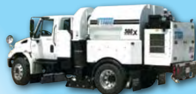
MODEL 500x® High Side Dump