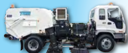
MODEL 600® Cabover Chassis