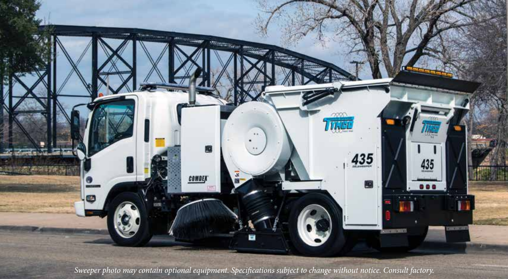
Sweeper photo may contain optional equipment. Specifications subject to change without notice. Consult factory.