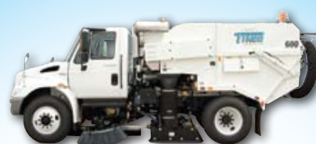
MODEL 600® Conventional Cab Chassis