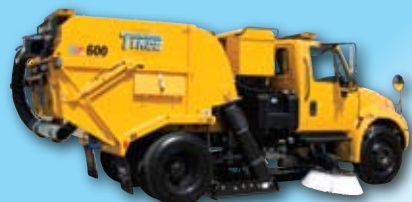
MODEL HSP® High Speed Performance for Airport Runways

Specifications subject to change without notice.