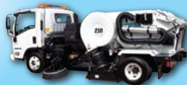
MODEL 210® Cabover Chassis

TYMCO REGENERATIVE AIR SWEEPERS are AQMD Rule 1186 Certified PM 10 -Efficient