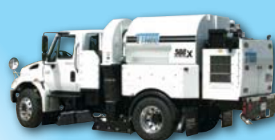
MODEL 500x® High Side Dump