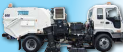
MODEL 600® Cabover Chassis