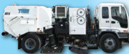
MODEL DST-6® Dustless Sweeping Technology

TYMCO REGENERATIVE AIR SWEEPERS are AQMD Rule 1186 Certified PM 10 -Efficient