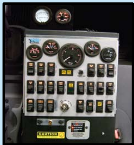
Operator friendly Sweeper Control Panel illuminates for easy night vision.

Heavy-duty Isuzu 17,950 lb. GVW chassis can be equipped with optional dual steering.