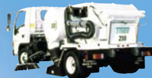
MODEL 210® Cabover