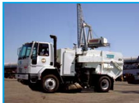
TYMCO's Model DST-6 is at home cleaning America's port facilities...