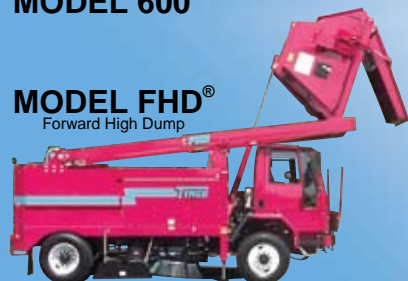
MODEL FHD® Forward High Dump

0602 - 20M - 01SM © TYMCO International, LTD., 2002