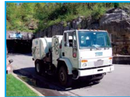
The DST-6 delivers superior performance above ground, in mining and storage applications...

And in underground applications, where clean air is essential.