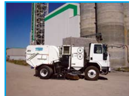
It's equally efficient cleaning in and around cement applications.