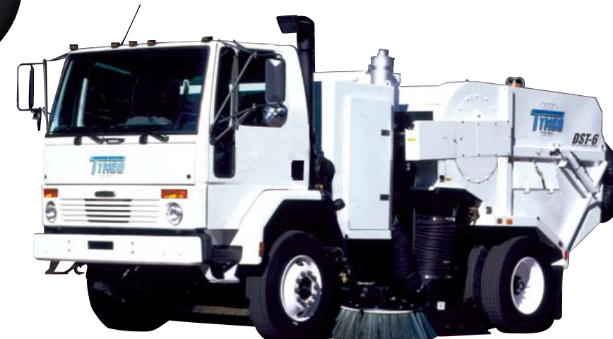
A patented Self-Contained Multiple Filtration System enhances the Regenerative Air System, allowing the DST-6 to keep cleaning Wet or Dry!