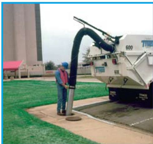
The DST-6 can be equipped with TYMCO's powerful Auxiliary Hand Hose option, allowing easy clean-up of those hard to reach applications such as catch basins and around garbage containers and compactors. The powerful suction power enables you to clean catch basins up to 20 feet deep. Controls are located at the rear of the sweeper for greater operator safety.